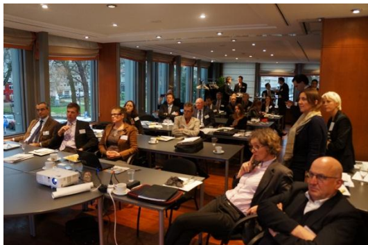
Representatives from EC, regions and HyER board