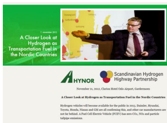
Web invitation for Nordic Conference

The event was shaped into the conference “A Closer Look at Hydrogen as Transportation Fuel in the Nordic Countries”, which took place on 21 November 2012 at the Clarion Hotel Oslo Airport Gardermoen. During this conference, Hydrogen Sweden presented the H2moves Scandinavia project outcomes and results to an engaged audience, and participated in an interesting panel discussion.