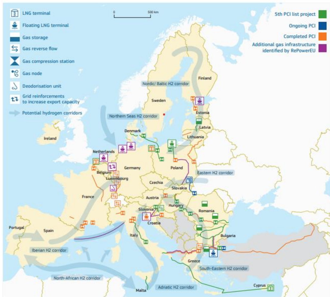
European infrastructure map for electricity